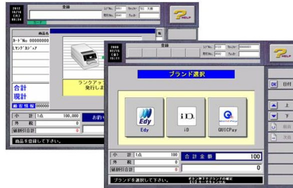
TOSHIBA TEC Design Department 2004/8/16